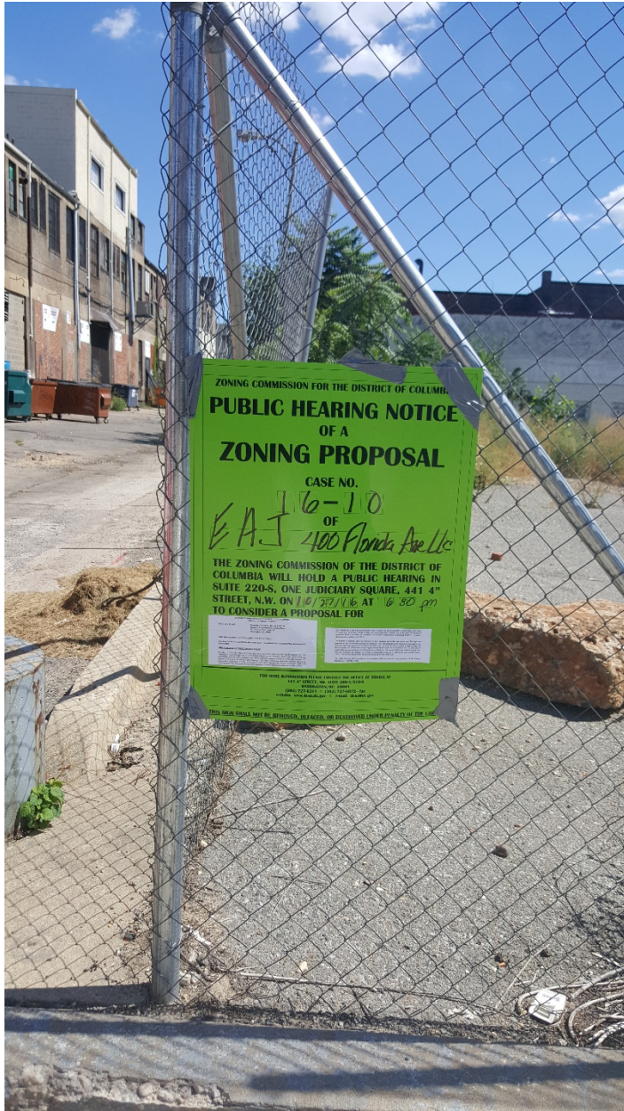
3. ZC 16-10 Posted 9/12/16