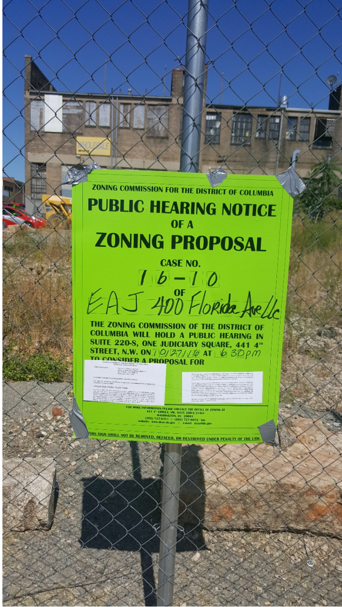
1. ZC 16-10 Posted 9/12/16