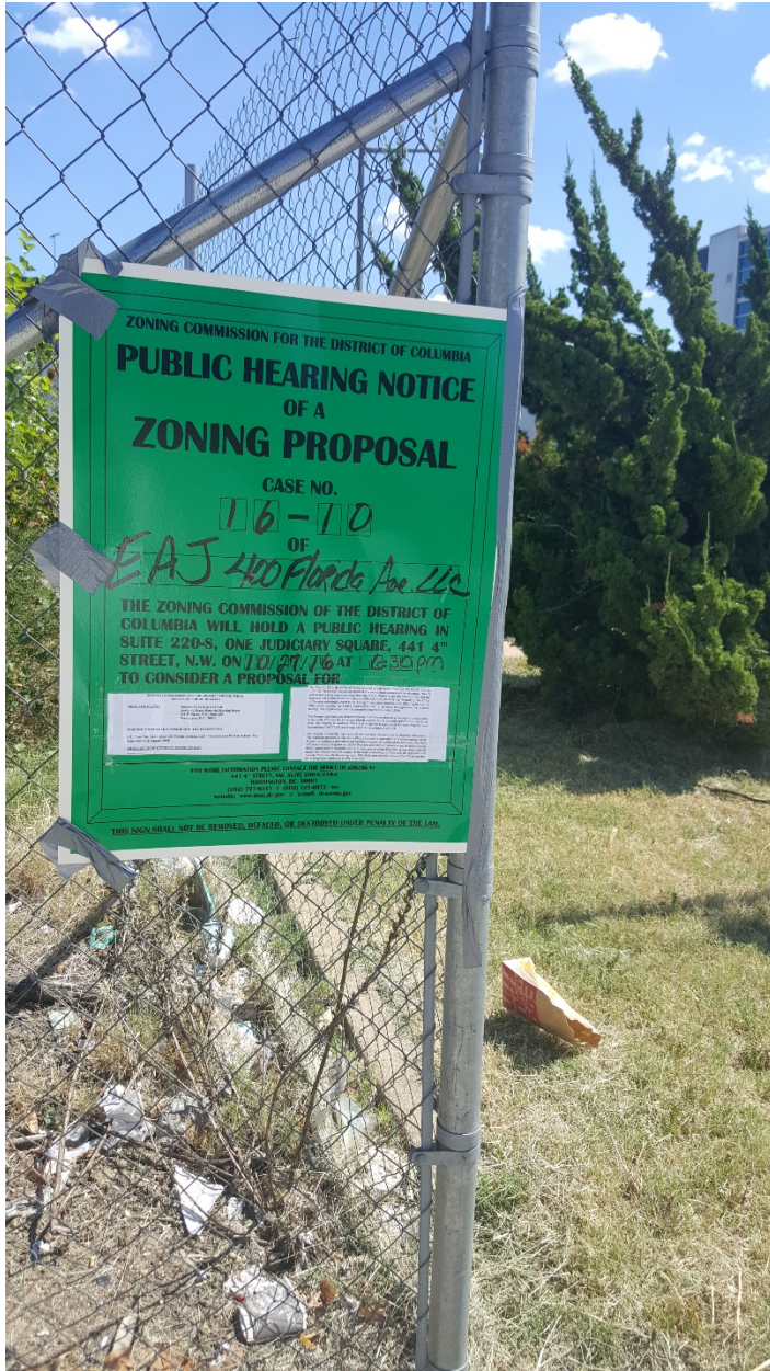
2. ZC 16-10 Posted 9/12/16