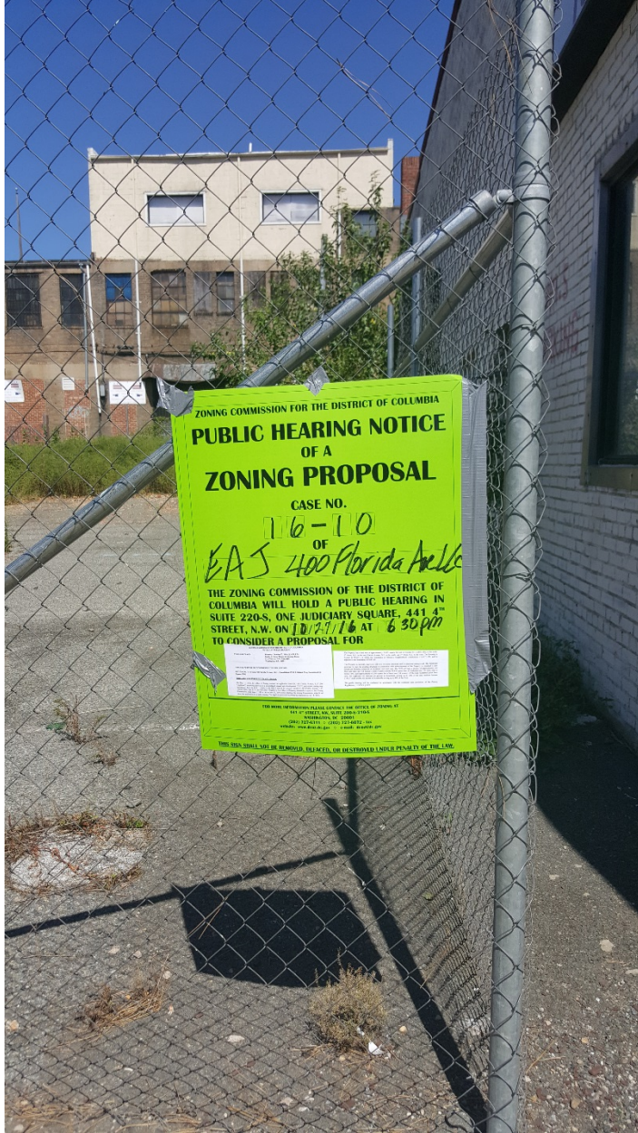
4. ZC 16-10 Posted 9/12/16